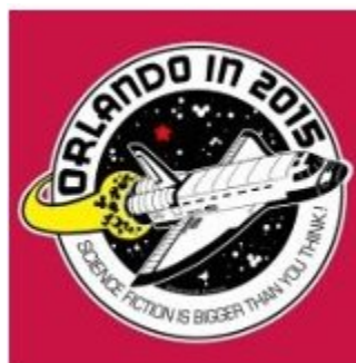
Orlando in 2015