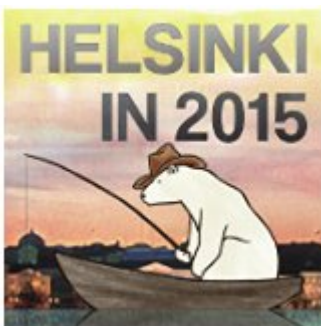
Helsinki in 2015