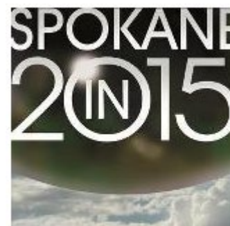
Spokane in 2015