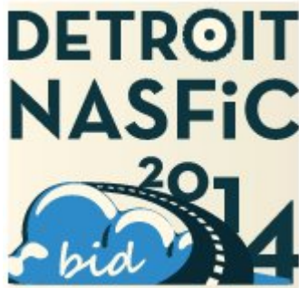
Detroit in 2014