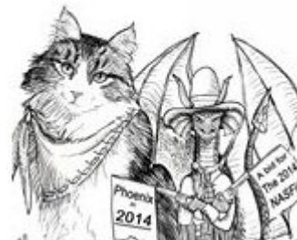
Phoenix in 2014